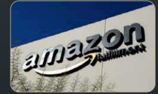
Amazon Data Centre 15mins