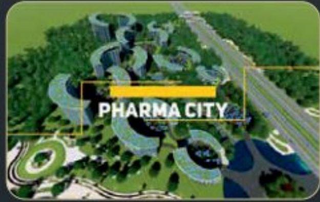
Pharma City 2mins