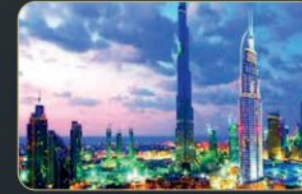
FAB City 15mins