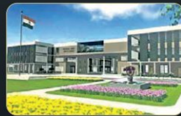
RR Dist. Collector Office 25mins