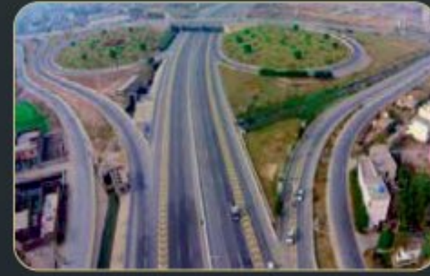
Regional Ring Road 10mins