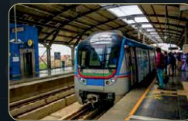
Metro LB Nagar 55mins

Discover a tranquil experience where everything from well curated plots & sophisticated facilities rejuvenate the mind & soul. Each plot offers the convenience & serene comfort.