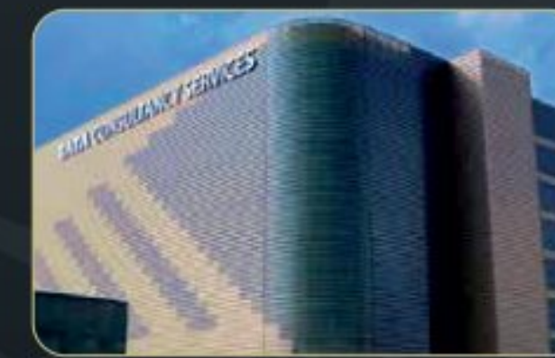
TCS Adibatla 30mins