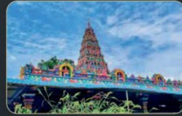
Maisigandi Temple 5mins