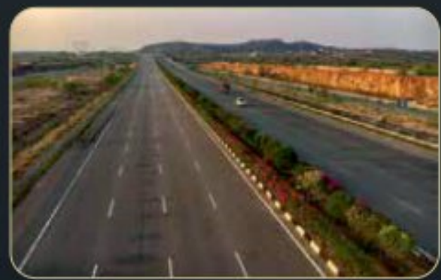
ORR (Tukkuguda) 20mins